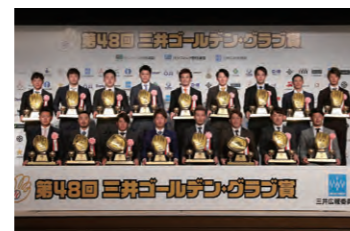
The 48th MITSUI Golden Glove Award Prizewinning players

We have co-sponsored a range of social contribution activities as a member company of the Mitsui Public Relations Committee, which consists of 24 Mitsui Group companies. This committee carries out a variety of cultural and art activities aimed at "enriching society by cherishing people and respecting diverse personal characteristics," working in line with the characteristics of the Mitsui Group described as "Mitsui is People."