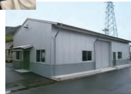
Newly built training lab at the Mitsui E&S Tamano Works