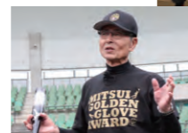
Sadaharu Oh, Chairman of the World Children's Baseball Foundation (WCBF)