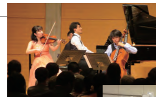
August 2, 2019 Aoi Trio concert for persons with disabilities (Tokyo Opera City)

The activities of the Fureai Trio commenced in 2003 with a desire to expose children and people with disabilities, who have few opportunities to be exposed to classical music, to live classical music and enrich their lives spiritually. The three have been doing more since 2019 by holding the Fureai Concert. Since these activities began, the Mitsui E&S Group has not only provided sponsorship but also helped in terms of volunteers at the concert hall, etc.