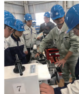
Practical training on the lathe

Founded in Tamano City, Okayama Prefecture in 1917, the Company, working together with Tamano City, has developed the Tamano Human Resource Regional Development Project centered on the establishment of a new industrial department at Tamano Shoko (Commercial and Industrial) High School for the purpose of nurturing young people to support the manufacturing industry. In addition to providing funds for the establishment of the school's mechanical engineering department, which was established in April 2018, Mitsui E&S provided a total of ¥100 million in support for training facilities and sending technical instructors, etc. Tamano City and the Company's efforts in this project were highly praised with both recently receiving the Ministerial Commendation for Local Revitalization Support Tax System (hometown tax for enterprises) established by the Cabinet Office. The school's mechanical engineering department is attracting attention as the first department in Japan to use a mechanical engineering training facility in a company, with students coming to learn not only from Tamano City but also from nearby Okayama and Kurashiki cities.