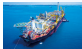
Solutions for Offshore Oil and Gas Production Projects