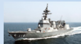
Naval and Governmental Ships