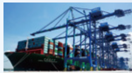
Crane & Systems