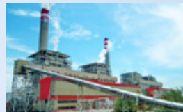
Overseas EPC Contractor for Civil/Architectural Works