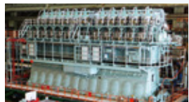
Marine Propulsion System