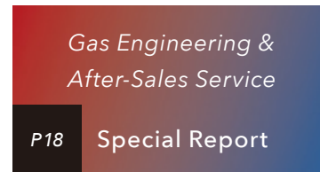
P18 Special Report Detailed explanations of our initiatives for business model innovation.