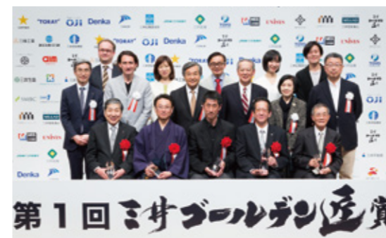
We held a memorable first award presentation ceremony.

MES has co-sponsored various cultural activities as a member company of the Mitsui Public Relations Committee. MES carries out various activities aimed at "enriching society by cherishing people and respecting diverse personal characteristics," working in line with the characteristics of the Mitsui Group described as "Mitsui is People." One example is the MITSUI Golden Glove Award, an award that stresses the importance of fielding in professional baseball. In 2015, the committee created the MITSUI Golden Takumi Award. Japanese traditional crafts face a number of problems, such as the lack of people to carry on these traditions. Through this award program, the committee provides opportunities for people to gain attention and praise for successfully carrying on traditional techniques and styles and combining them with innovative ideas, thereby helping to further the development of traditional crafts.