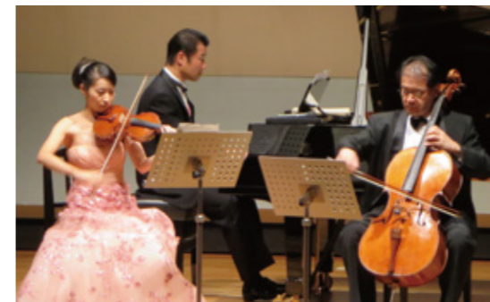
We hold full-scale classical music concerts for people in local communities.

Children and people with disabilities have few opportunities to be exposed to classical music. The activities of Fureai Trio started with a desire to expose these people to live classical music and spiritually enrich their lives. The trio has given 410 public performances for more than 95,000 people. Since the activities of the Fureai Trio started in 2003, MES has not only co-sponsored its events, but has also provided volunteer services to support its concert activities.