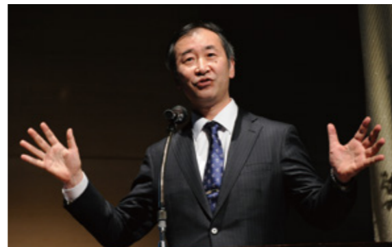
Professor Takaaki Kajita talking about his research

In 2015, Takaaki Kajita, the Director of Institute for Cosmic Ray Research and Professor at the University of Tokyo, was awarded the Nobel Prize in Physics for discovering neutrino oscillations. The Super-Kamiokande is the neutrino detector facility that supported this research project, which has succeeded in expanding the intellectual frontiers of humankind. MES was involved in the construction of this facility from the schematic plan phase. In 2001 a chain reaction of implosions destroyed the original facility. Following this major accident, MES worked together with researchers to determine the cause of the chain reaction. A lecture meeting to commemorate Professor Kajita's winning the Nobel Prize was held in March 2016. The meeting was hosted by the Asahi Shimbun Company and co-sponsored by MES. High school and university students were invited to the meeting, and Professor Kajita sent a message to the young people. In addition to the Super-Kamiokande, MES has participated in the construction of the Japan Microgravity Center located in Kamisunagawa Town, Hokkaido, and KamLAND, a neutrino detector owned by Tohoku University. We will continue to provide technological support to researchers who enthusiastically take on new challenges.