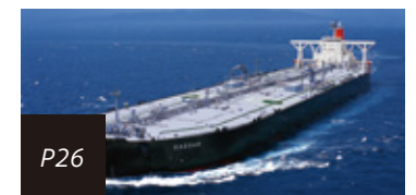
Medium- & Long-Term Management Plans